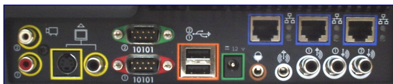
Rear connections to the AP-100